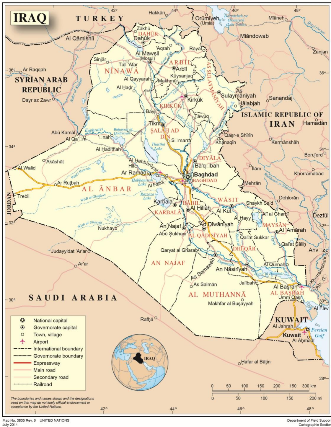
Map: UN, Iraq - Map No 3835 Rev. 6, July 2014, ( url ).